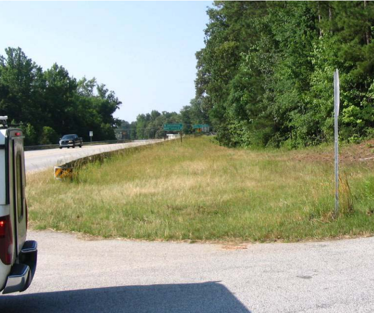
View from Intersection of Burnt Bridge Rd. & Hwy 25.

*AADT: Average Annual Daily Traffic (Number of vehicles)