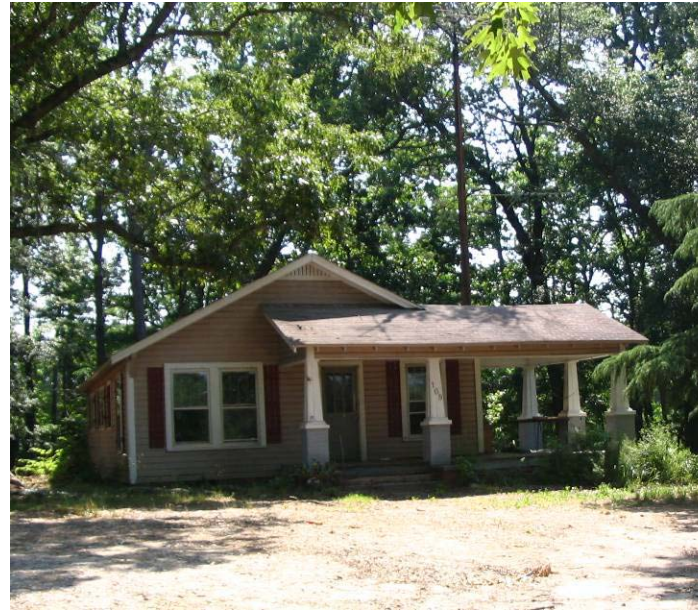
House on property sold "AS-IS"