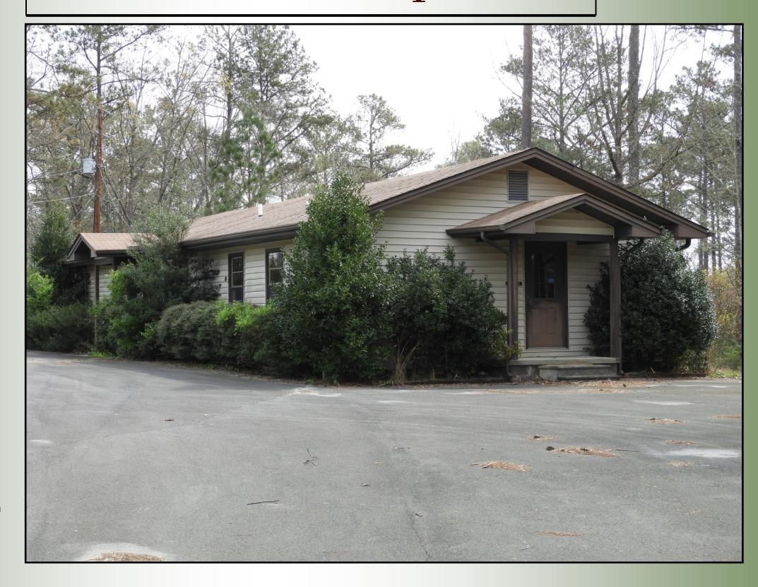
257.01 Acres | 4546 Huffaker Road | Floyd County, GA | 30165