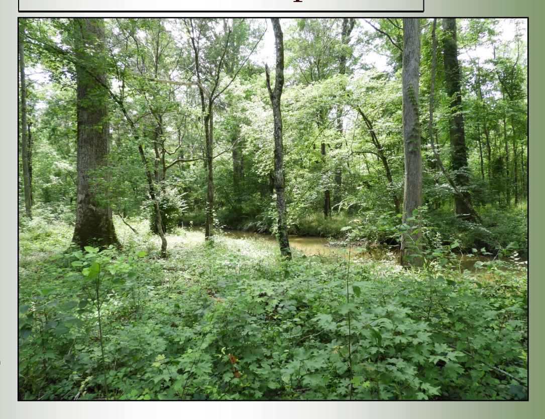
26.56 Acres | Mays Bridge Road | Floyd County, GA | 30165