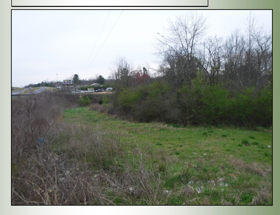
11.42 Acres | US Hwy 441 S | Jackson County, GA | 30529