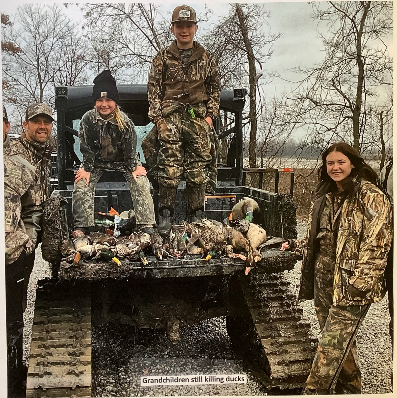
Grandchildren still killing ducks