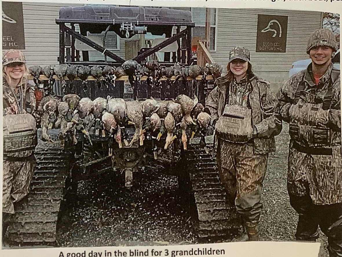
A good day in the blind for 3 grandchildren

SALE PRICE: $3,000,000.00 Cash, walk out sale, less owner's ranger, duck boat, personal tools.