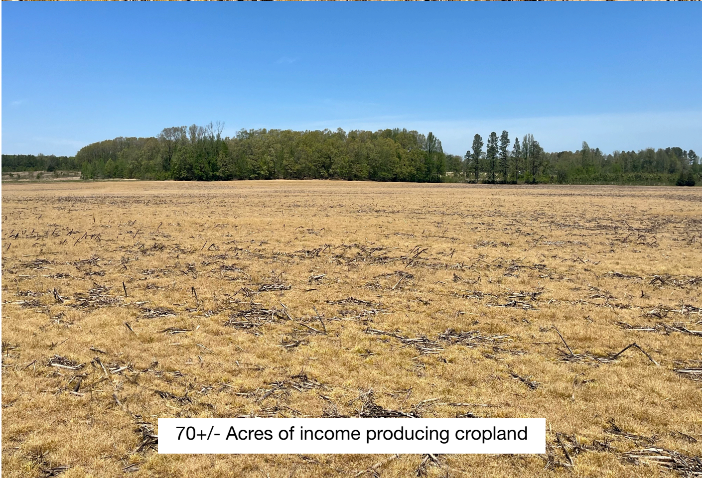
70+/- Acres of income producing cropland