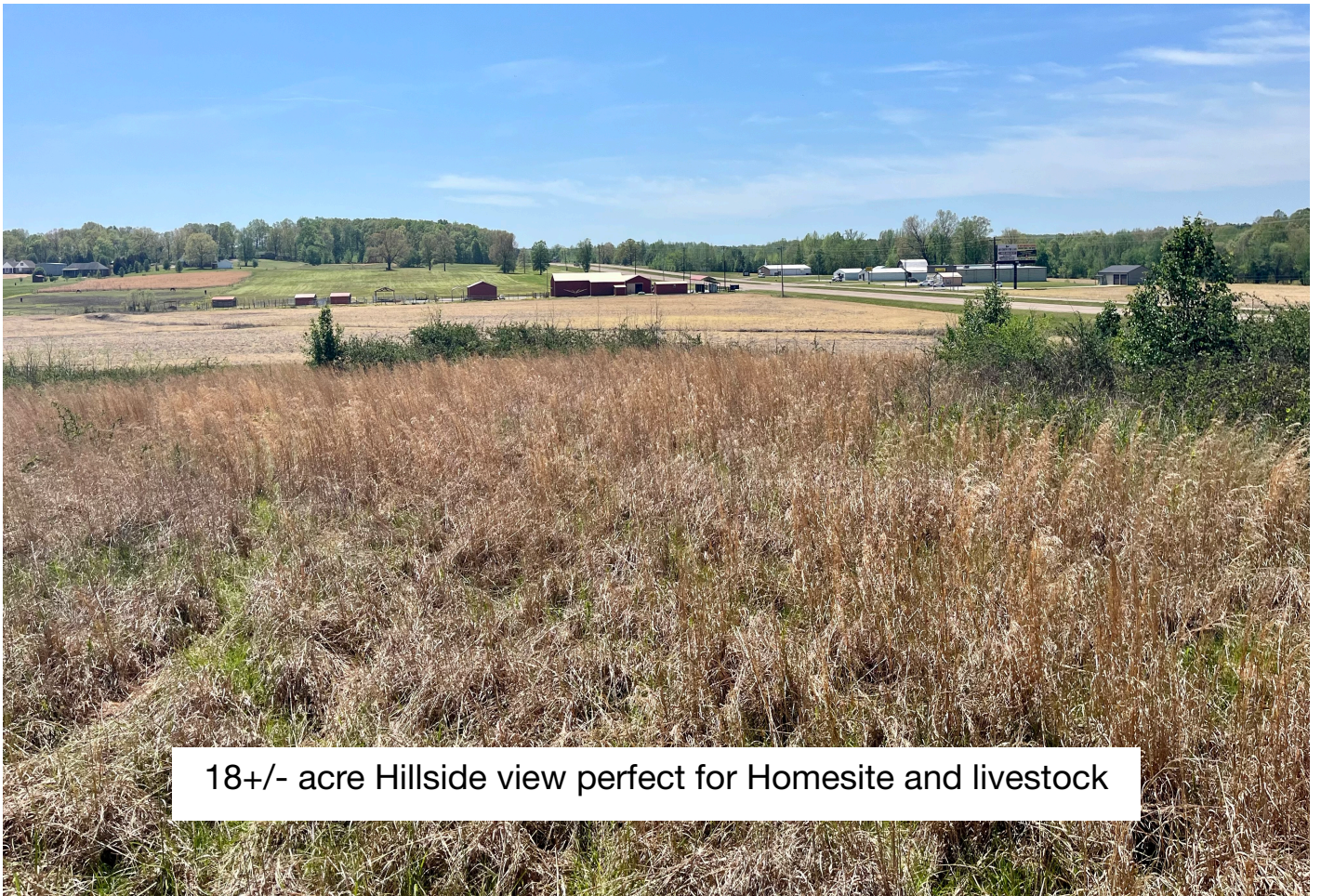
18+/- acre Hillside view perfect for Homesite and livestock