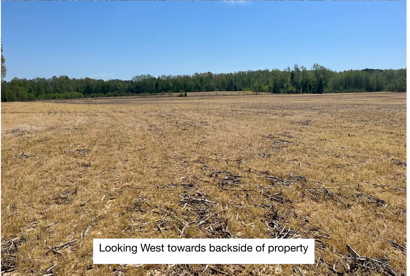
Looking West towards backside of property