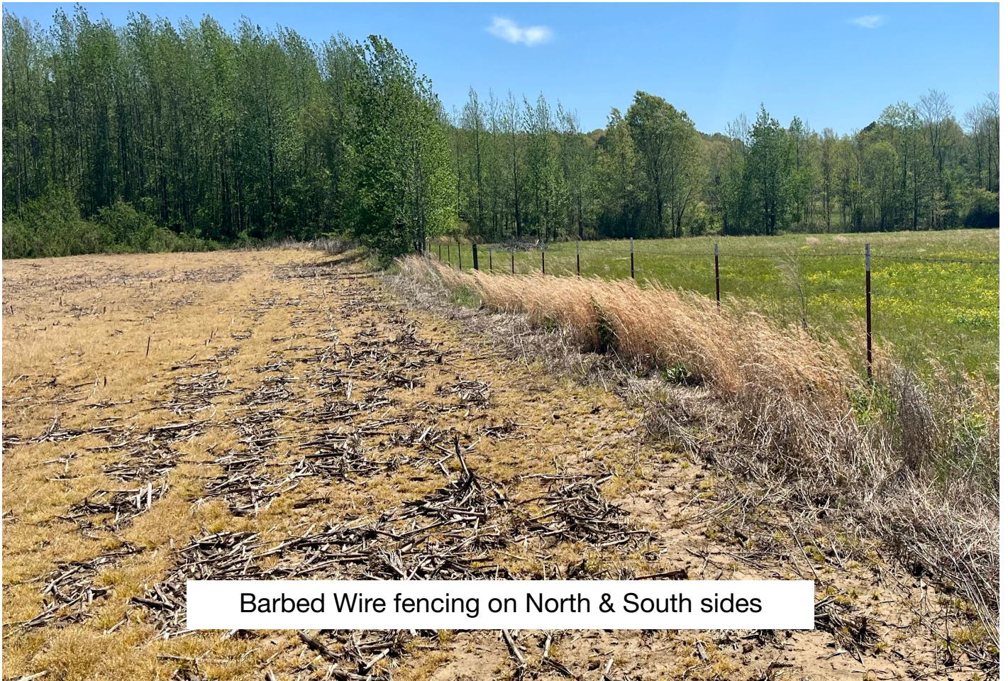
Barbed Wire fencing on North & South sides