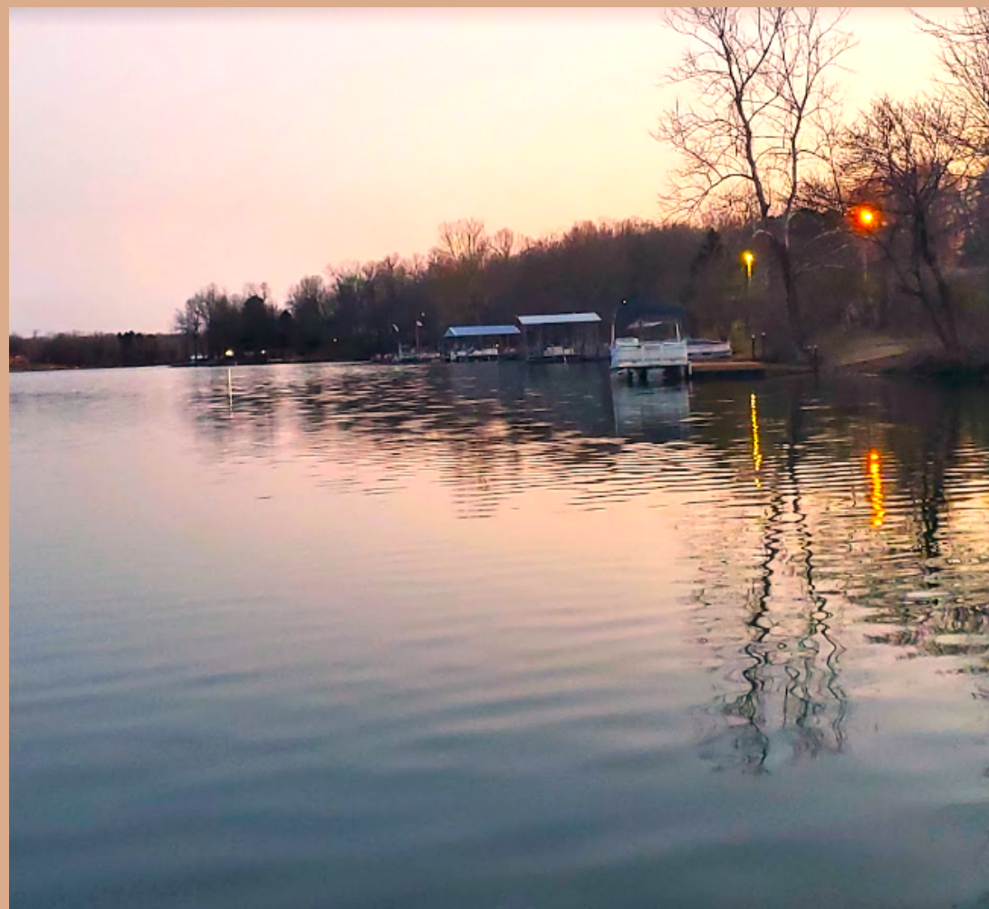
Crown Lake Pier