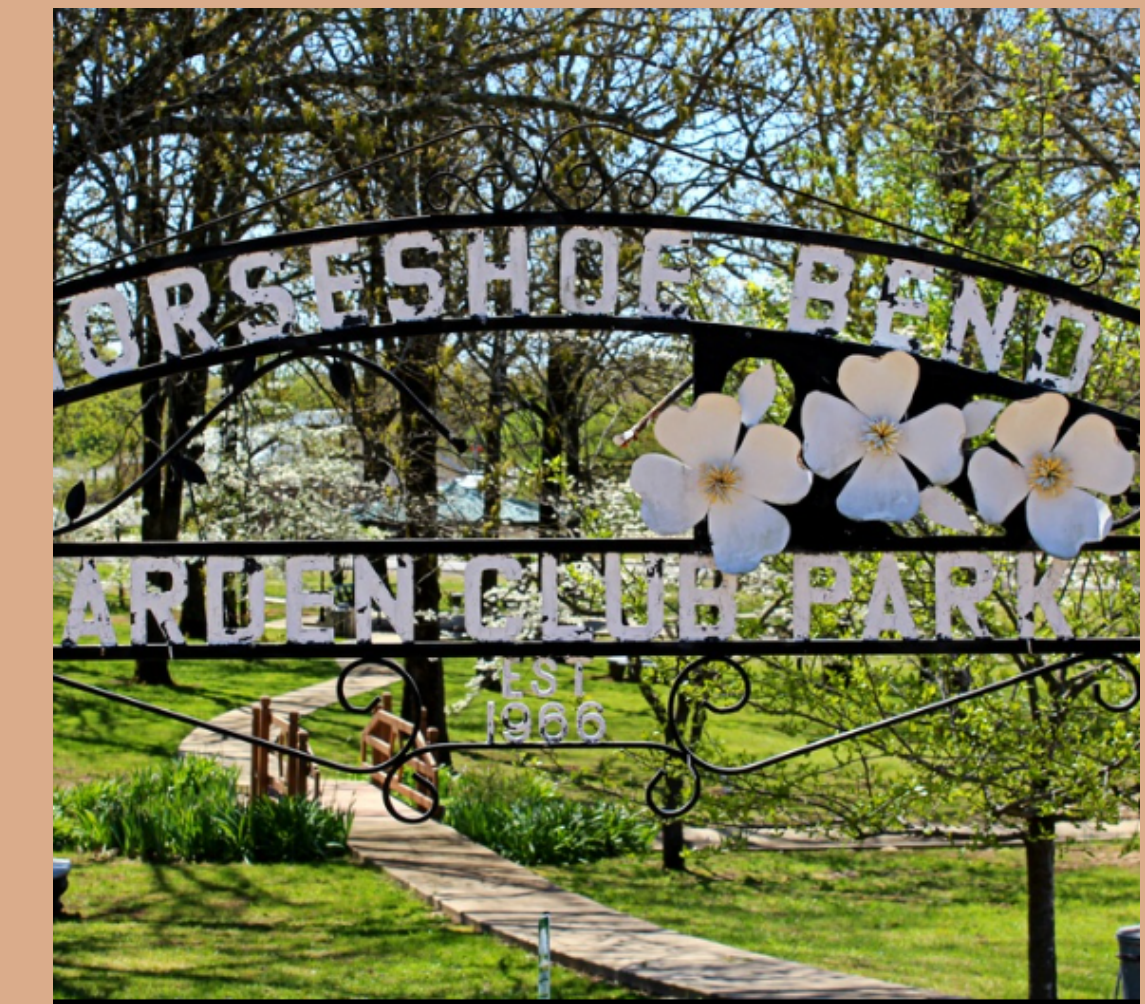
Horseshoe Bend Garden Club Park