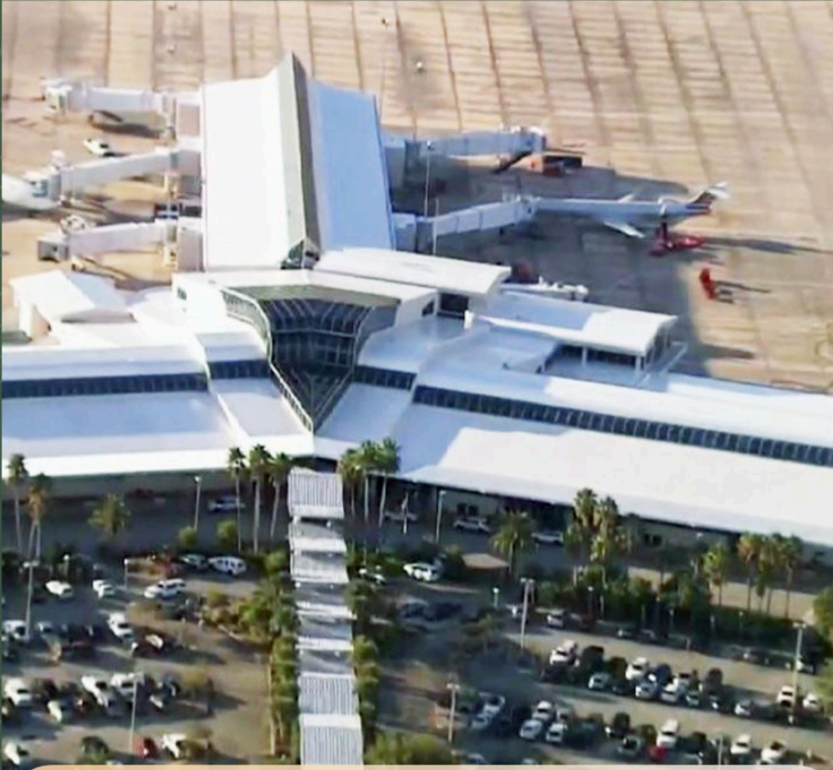
Daytona Beach International Airport