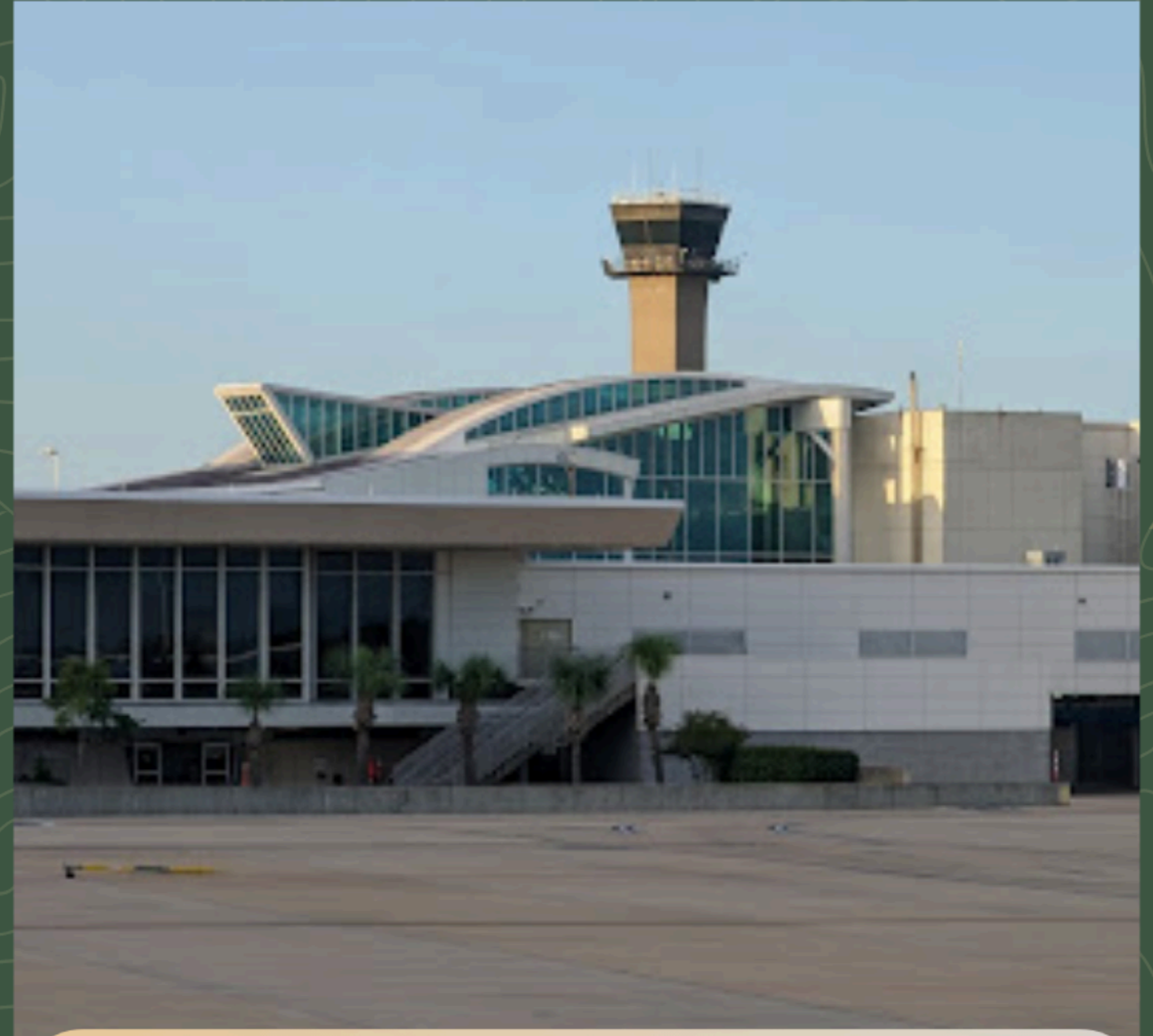
Jacksonville International Airport