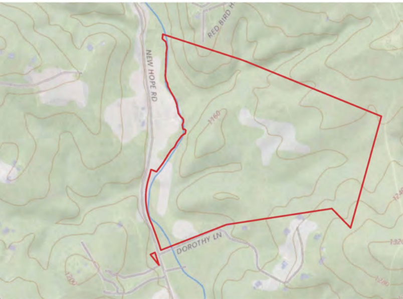
National Wetlands Inv.