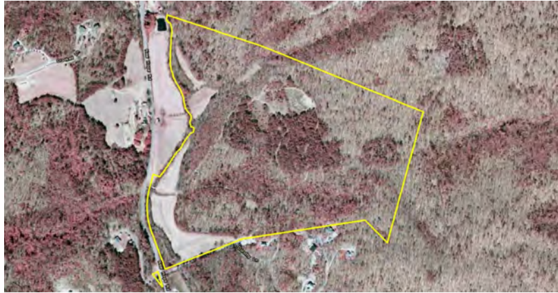
FEMA Flood Zones