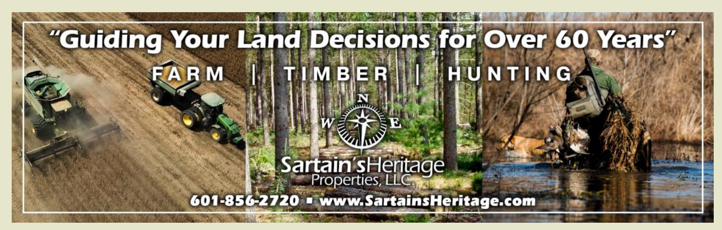
All information contained herein is supplied by sources deemed reliable, but is not guaranteed by Sartain's Heritage Properties, its Brokers or Agents. Properties are subject to errors, omissions, correction, price change, prior sale or withdrawal without notice. All Buyer's agents are required be identified on the first contact with Broker/Agents of Sartain's Heritage Properties and must accompany the buyer on showings to receive full fee participation. Otherwise, the fee participation shall be at the sole discretion of the Broker and Sartain's Heritage Properties.