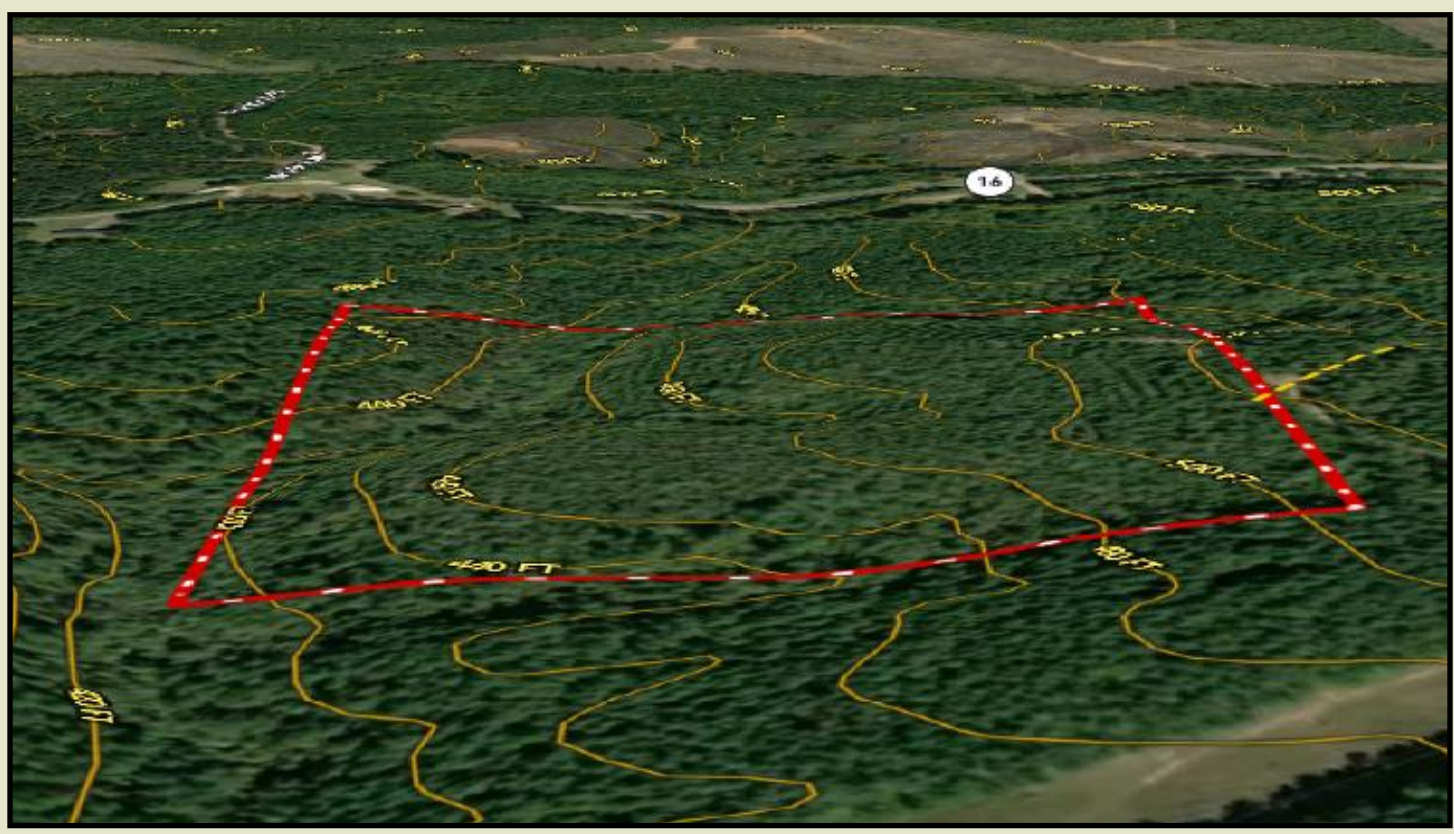
All information contained herein is supplied by sources deemed reliable, but is not guaranteed by Sartain's Heritage Properties, its Brokers or Agents. Properties are subject to errors, omissions, correction, price change, prior sale or withdrawal without notice. All Buyer's agents are required be identified on the first contact with Broker/Agents of Sartain's Heritage Properties and must accompany the buyer on showings to receive full fee participation. Otherwise, the fee participation shall be at the sole discretion of the Broker and Sartain's Heritage Properties.