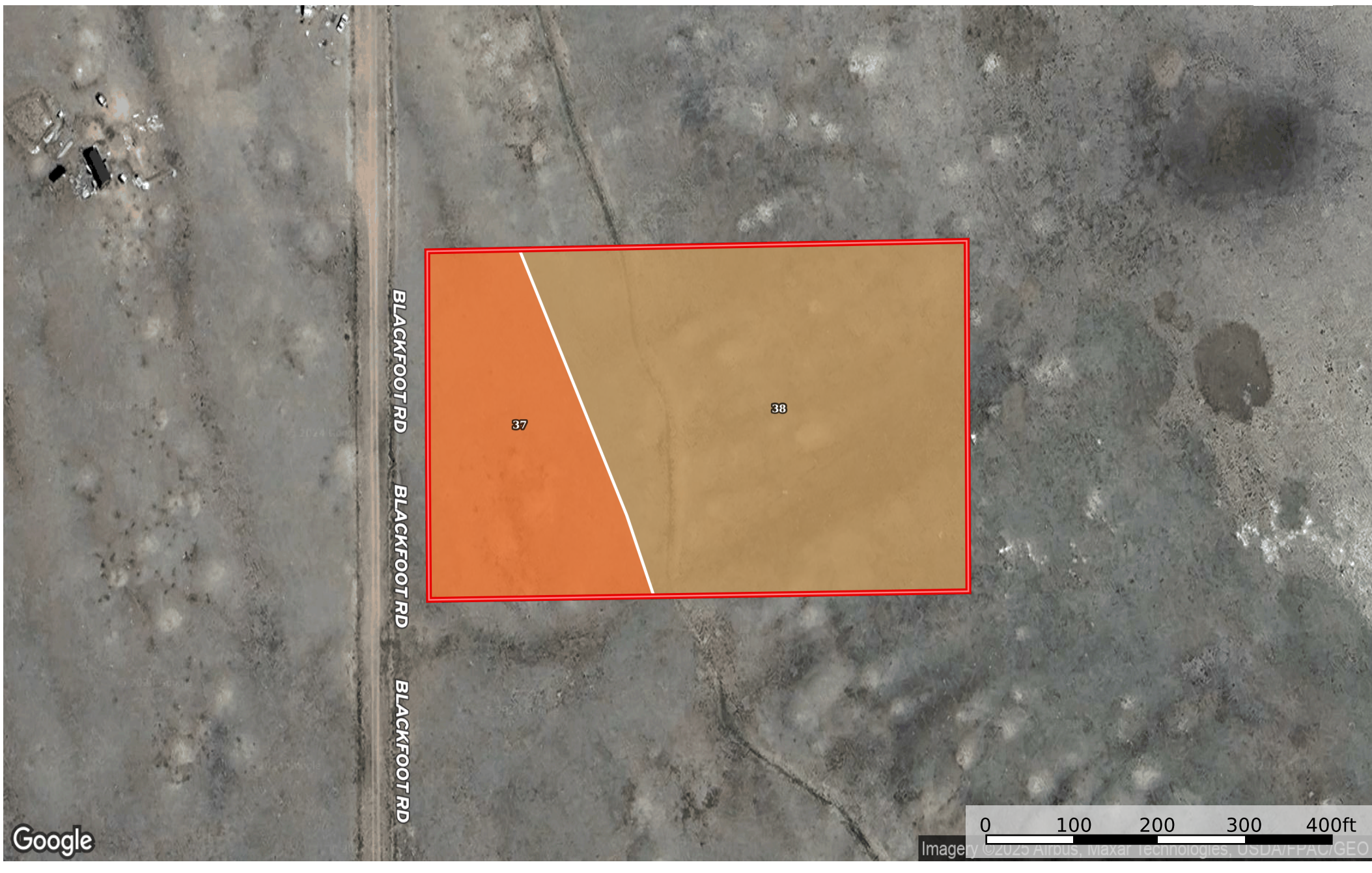
5.05 Acres Hartsel, Park County, CO 6494 Park County, Colorado, 5.05 AC +/-