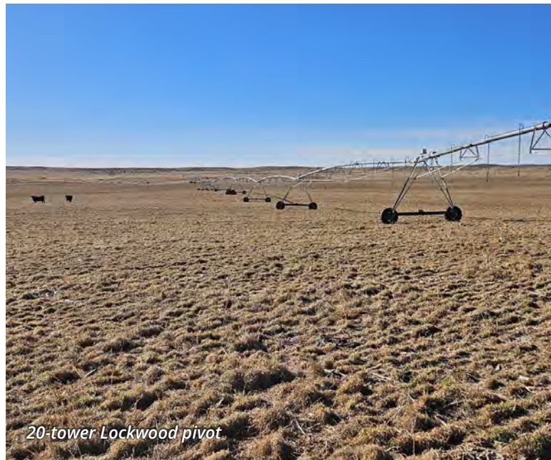
20-tower Lockwood pivot