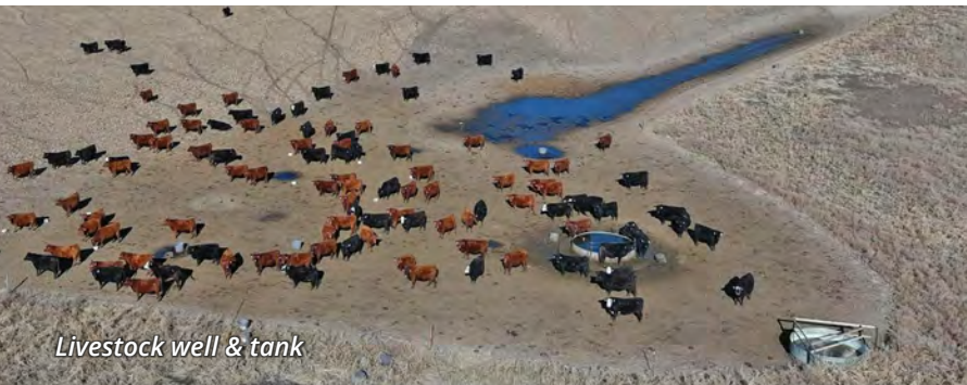
Livestock well & tank

The reserve/opening bid set at $2.3M, meaning that the reserve will be met after the first bid is placed.