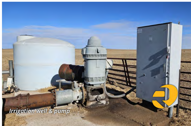
Irrigation well & pump