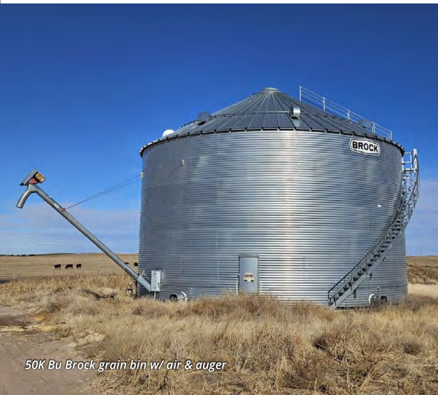
50K Bu Brock grain bin w/ air & auger