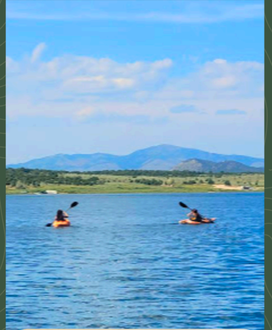
Mountain Home Reservoir