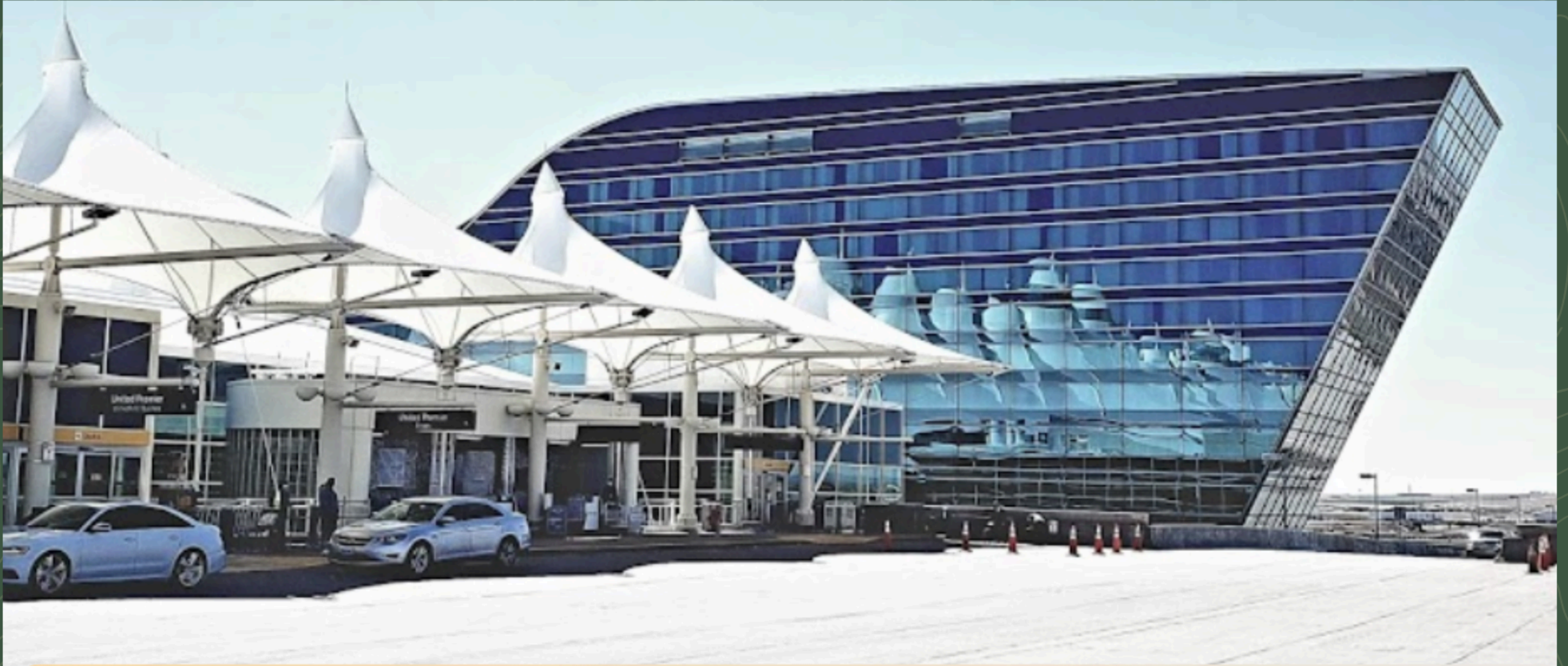
Denver International Airport