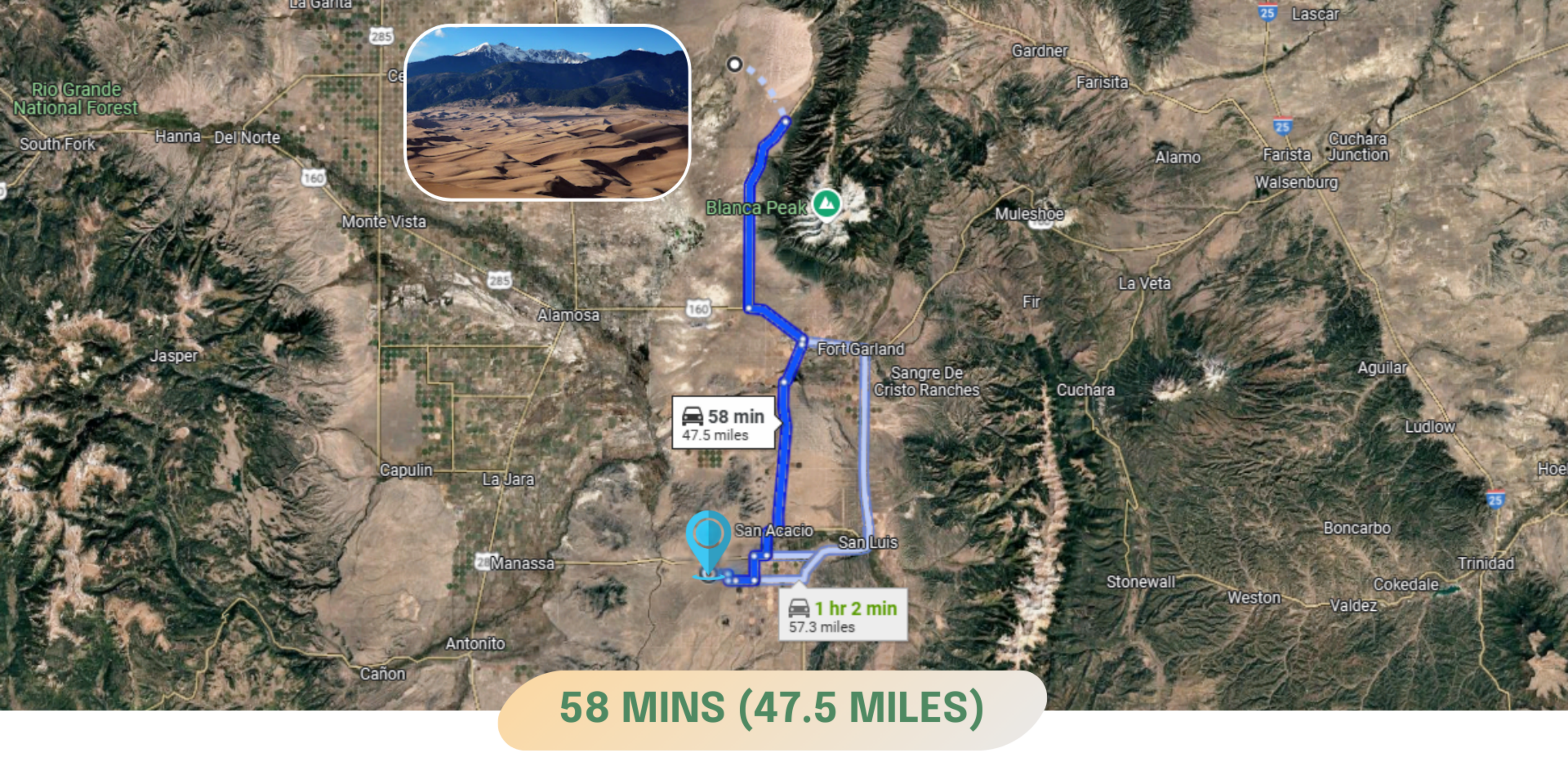
THIS PROPERTY IS 58 MINS (47.5 MILES) TO GREAT SAND DUNES NATIONAL PARK AND PRESERVE IN DUNCAN, CO.