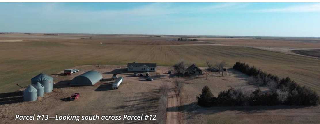
Parcel #13—Looking south across Parcel #12