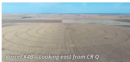
Parcel #4B—Looking east from CR Q