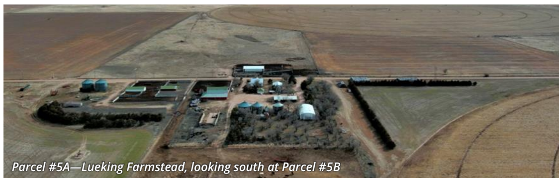
Parcel #5A—Lueking Farmstead, looking south at Parcel #5B