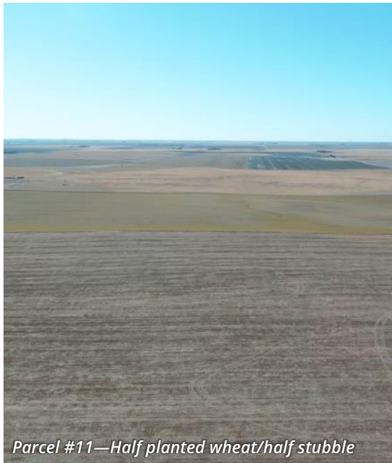
Parcel #11—Half planted wheat/half stubble