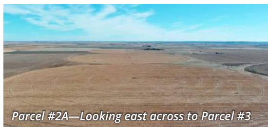
Parcel #2A—Looking east across to Parcel #3