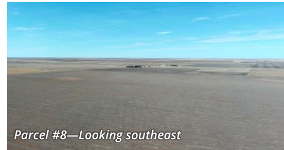
Parcel #8—Looking southeast