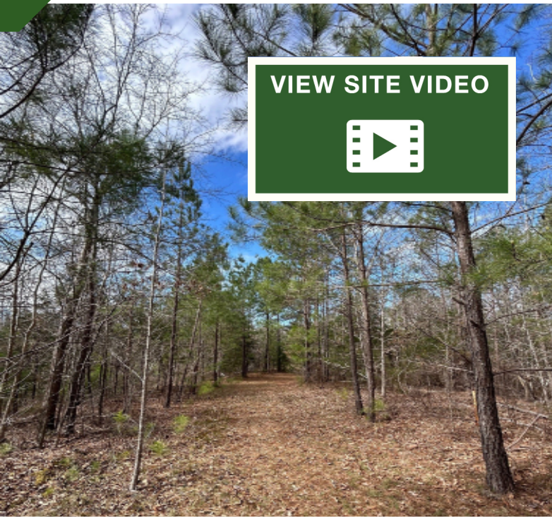
Beautiful and Manageable Property with Creek Frontage & Hunting Opportunities